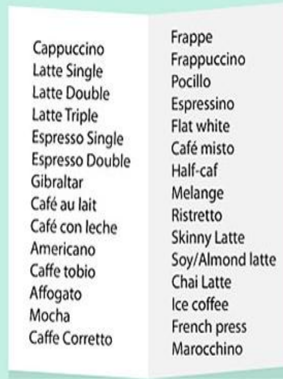
Coffee beverages in 2014