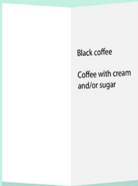
Coffee beverages in 1996