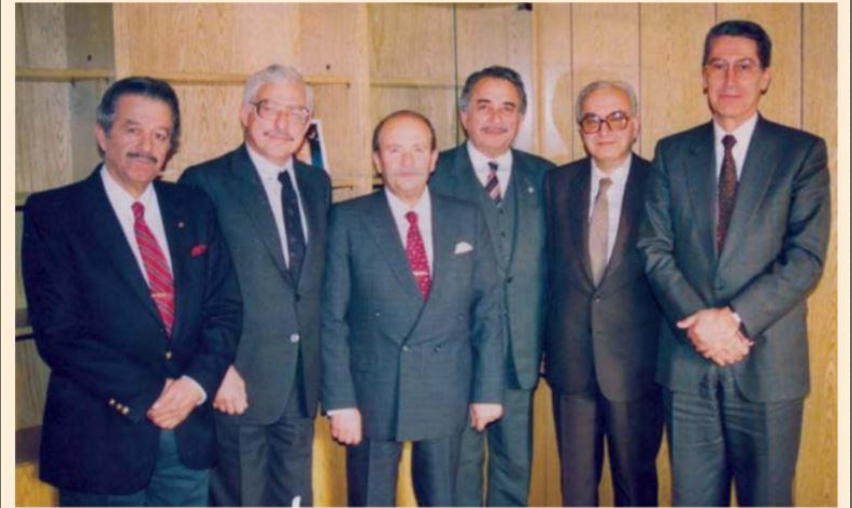
Türk Cerrahi Derneği Yönetim Kurulu, ilk Genel Merkezimizde bir arada.